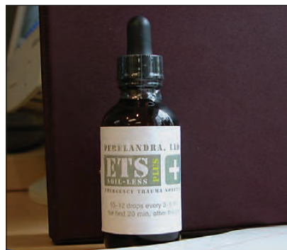
Perelandra ETS Plus for Soil-less Gardens Prepared and distributed by Perelandra, Ltd., Warrenton, VA 20188

ETS Plus for Soil-less Gardens is environmental and security-device protected and is not affected by environmental pollution or travel security procedures.